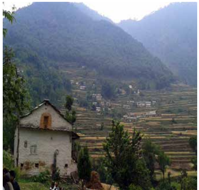
Terraced hillside with village.

Such objectives appear simple, but small-farm systems are complicated. The residents are typically affected by poverty, population pressure, and lack of development investment, so climate change must be considered in combination with other problems of daily life.