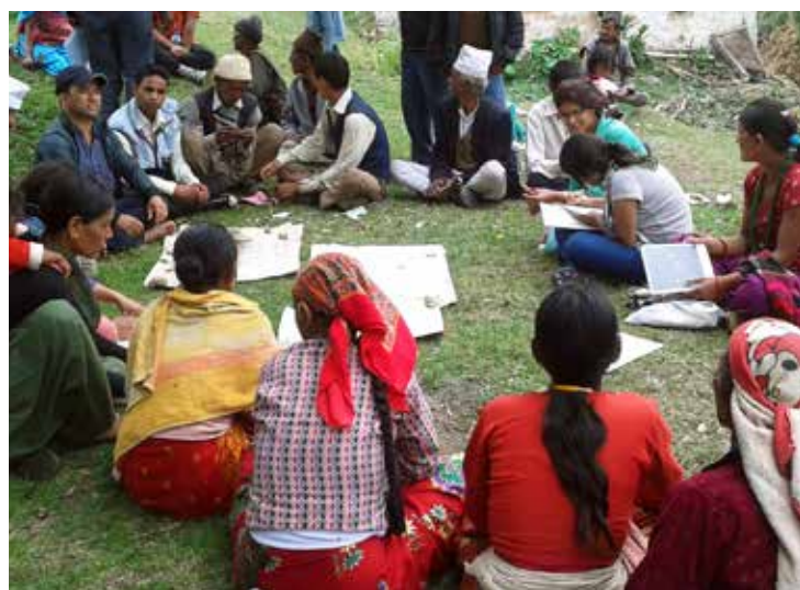
PRA session.

3. Lack of off-farm income sources. There are very few sources of cash income for farming households across all four of the communities, and people's income-generating skills are also limited. Local opportunities are needed to generate off-farm income to reduce the need for younger family members to go abroad under risky circumstances to find work. This problem is related to the inability of most farms to provide enough food for their household members. This, in turn, is due to small acreages with respect to a growing human population. Lack of local markets also plays a